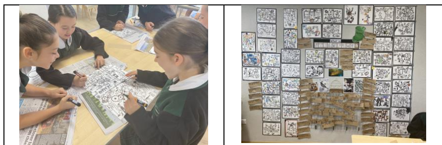
Year 6's: Steam Punk Art