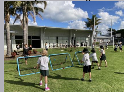
Lunch time fun: Crazy Catchers