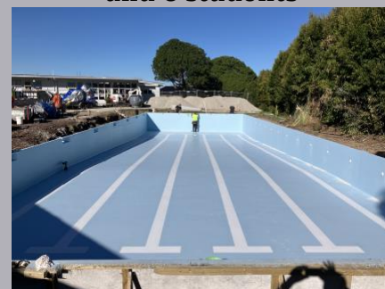
New pool is in the ground

Sunday 23 June – Thurs 27 June School Show for all year 5 and 6 students