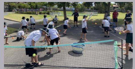
Tennis lessons at Hauraki this week

82 Jutland Road, Hauraki, Auckland 0622 Phone: 09 489 4568 | Fax: 09 489 4579 Email: office@hauraki.school.nz