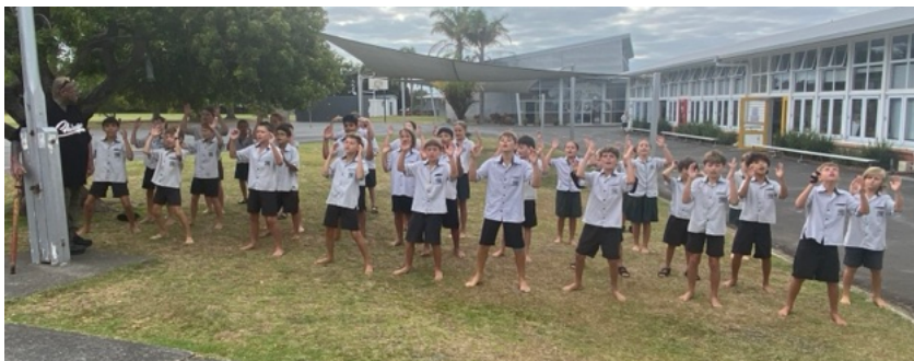
Kapa haka welcoming our ERO visitors on site this week

It has been a pleasure to share all our mahi with the Education Review Office this week. They were impressed with the culture of the school, what they saw in classrooms, the quality of teachers, and high standards of student achievement. Interviewing students gave them a good insight into the school through the eyes of children. It has been a great opportunity to reflect on all that we do and be thankful for the amazing staff we have at Hauraki. I am confident that we can look forward to a very positive report.