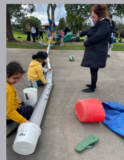
Loose parts play for junior this week