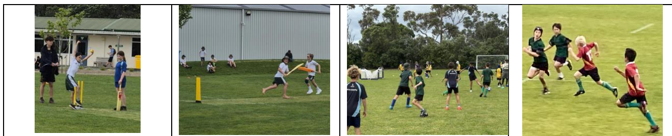
Photos from this week's Cricket and Girls and Boys Football Field Days