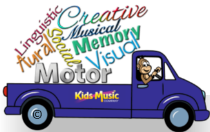
The Perfect Vehicle for Learning